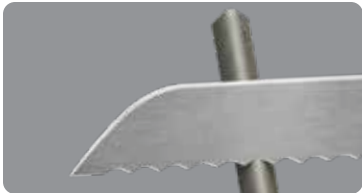
Serrated 3 radius rod for all size serrations