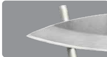
Straight Sharpen all your straight edged knives