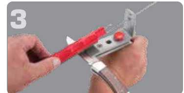
3 Sharpen One Side, Then Flip