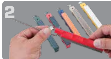
2 Assemble Hone on Guide Rod