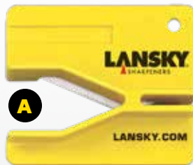
THE "MINI" KNIFE SHARPENER