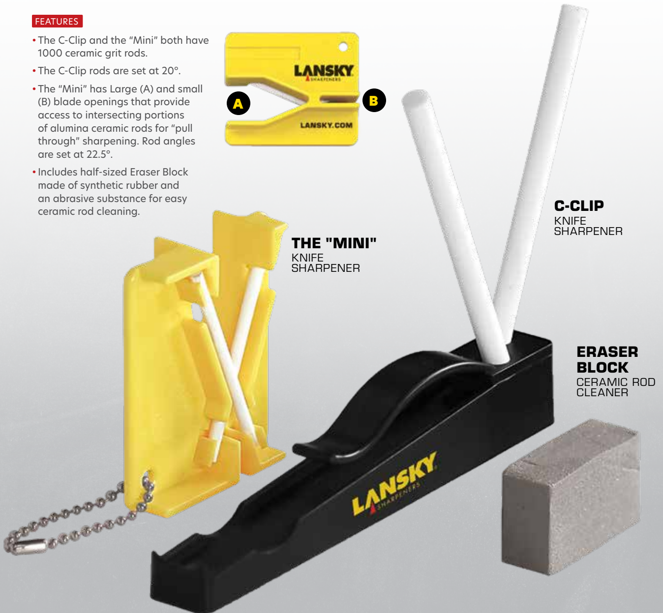
ERASER BLOCK CERAMIC ROD CLEANER