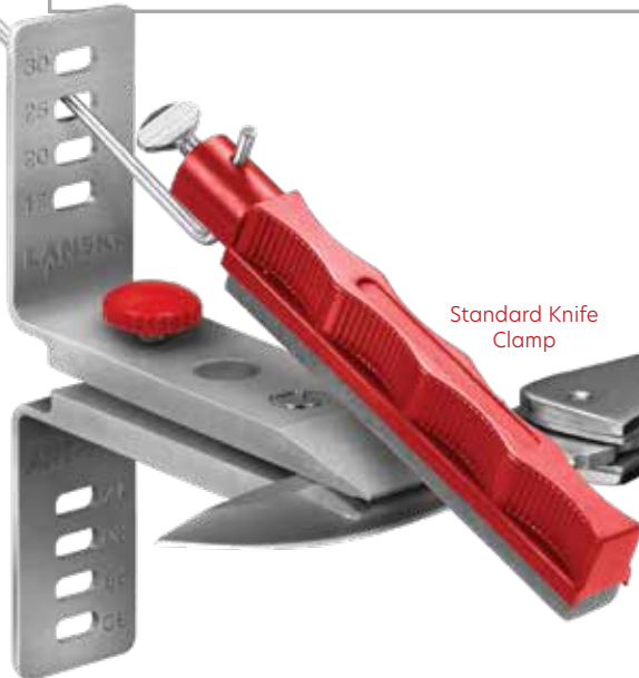
Standard Knife Clamp