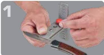
1 Attach Blade to Clamp

Replacement oil—perfectly sized for your Lansky kits.