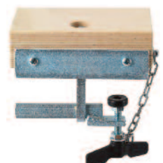
TABLE VISE HOLDER