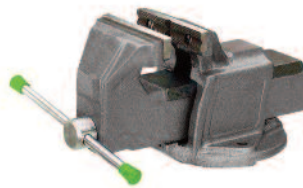
TABLE VISE WITH ANVIL