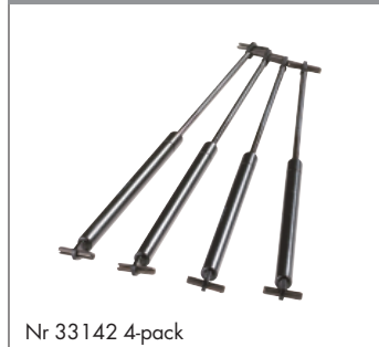
Nr 33142 4-pack