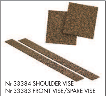
Nr 33384 SHOULDER VISE Nr 33383 FRONT VISE/SPARE VISE