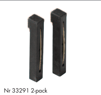
Nr 33291 2-pack